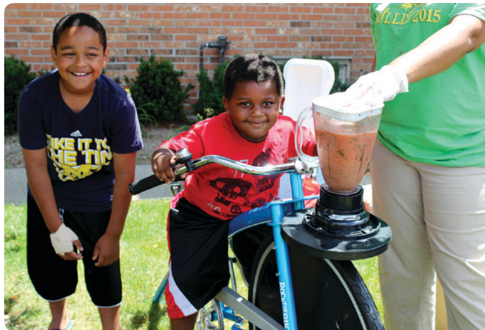
Children taking a turn riding the smoothie bike

Sponsored by your donations and the USDA, we are working to fill the gap in the summer months when children in low-income areas do not have access to free or reduced-price meals through the schools.