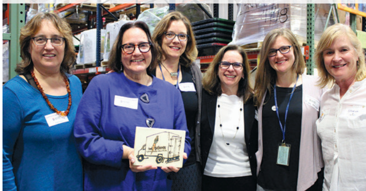
Community Gatherers Award