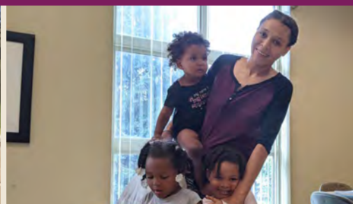
Food distribution volunteers and guests at partner programs in Washtenaw County.

Your support matters. Give now to share food and hope this year: www.foodgatherers.org/WNL22