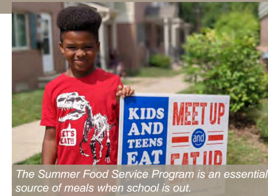
The Summer Food Service Program is an essential source of meals when school is out.