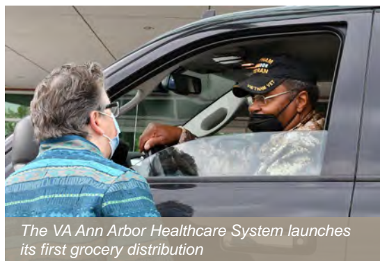
The VA Ann Arbor Healthcare System launches its first grocery distribution

Thank you for joining us for another year of fighting hunger where we live! As donors, volunteers, and compassionate neighbors, you are making a difference in the lives of our neighbors facing hunger. As you read the annual report, please take a moment to celebrate the power of our shared commitment to building a healthy and food-secure community. We also invite you to view the extended digital report online at www.foodgatherers.org/FY21 . Thank you for driving this important work!