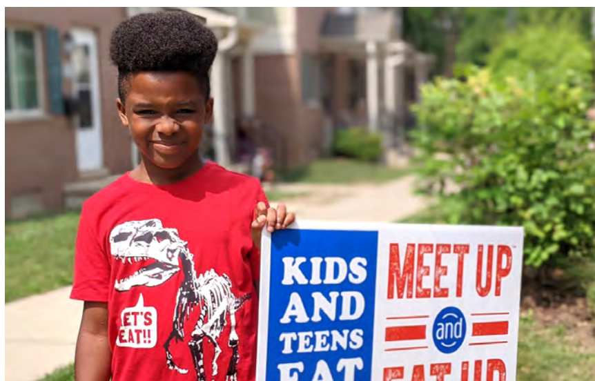
A SFSP attendee poses by the Meet Up and Eat Up sign at a food distribution site in Ypsilanti.