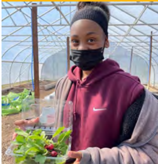
A WTMC student shows off an early harvest from the school's garden program.

Did you plant a garden this season? You can donate your extra harvest to fight hunger! Your donations of fresh produce help us meet our goal of distributing nutritious fruits and vegetables along with shelf-stable products. Bring donations to our warehouse at 1 Carrot Way, Ann Arbor, Monday–Friday, 9:00 a.m.–4:45 p.m.