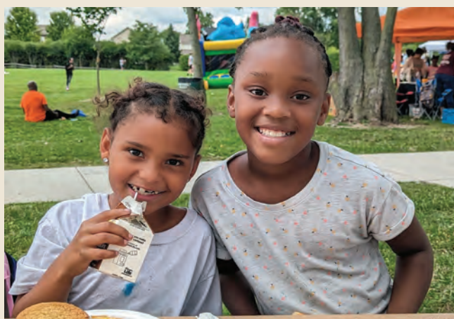
Families enjoy a cookout and end-of-summer celebration in Superior Charter Township.

Thank You The 2023 Summer Food Service Program was generously sponsored by the Michigan Department of Education, Toyota Research & Development, the Lake Trust Credit Union Foundation, and the Kiwanis Club of Ann Arbor Foundation.