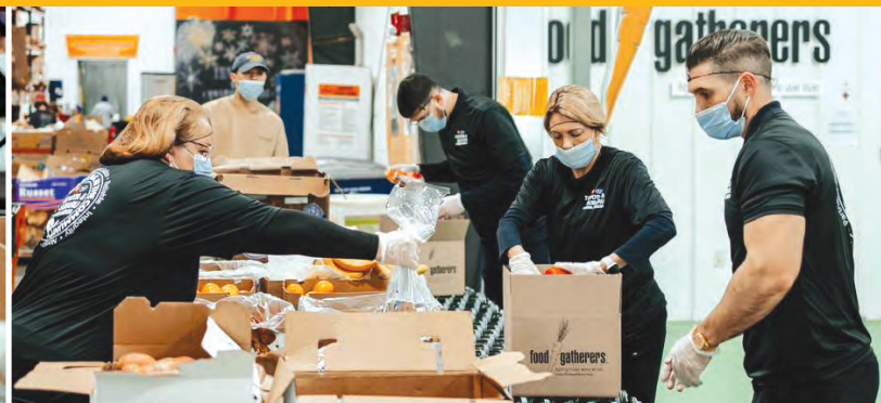
Toyota & Subaru of Ann Arbor volunteers pack produce boxes at Food Gatherers' warehouse.